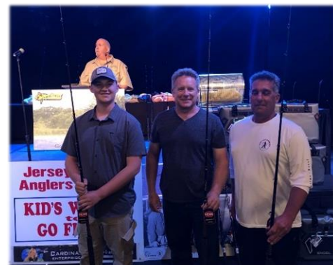
6 th Place: Tsunami Shield 5000 spinning reel & 2 JCAA T-shirts