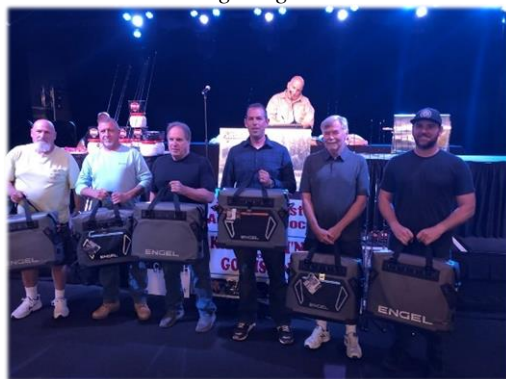
5 th Place: Engel Cooler