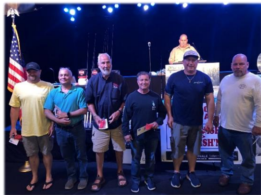
3 rd Place: One night stay at Resorts, $40 food voucher and Viking sunglasses