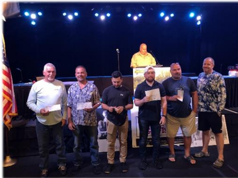
1 st Place: $1200 Cash