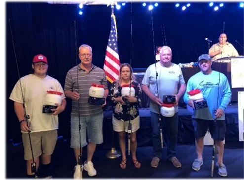
2 nd Place: Penn Squall Bait caster/Fenwick rod combo and a Bait Mule container w/Gulp