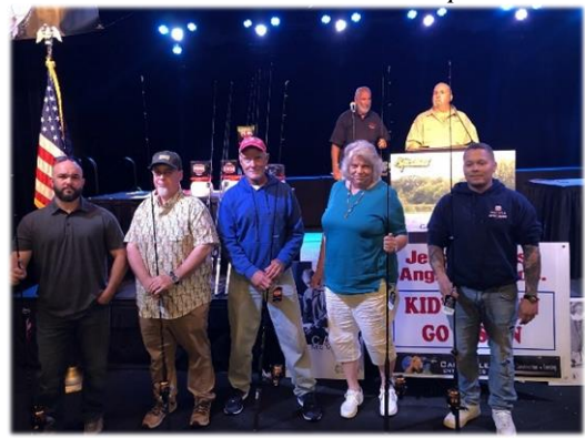
4 th Place: Penn Spinfisher 550 combo